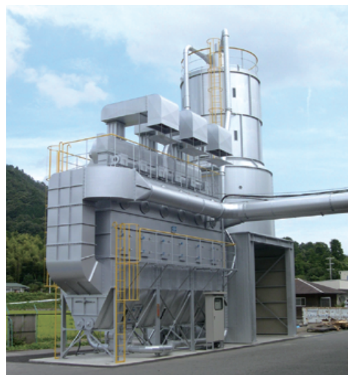
BFR5 × 6 (22kW×3) Truck loading LCA500