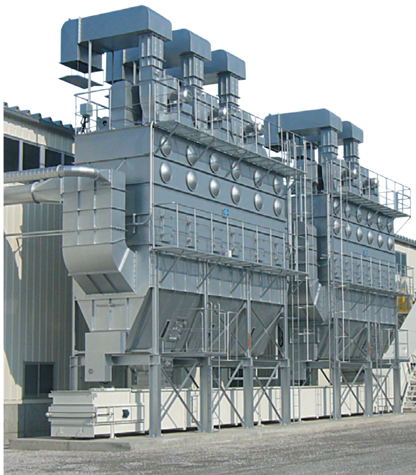
BFR5W × 6 (37kW×3)